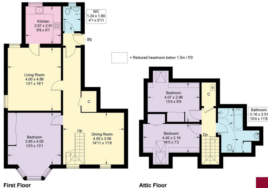
Illustration for identification purposes only, measurements are approximate, not to scale. (ID1267189)